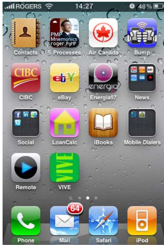
6. Click on VIVE icon