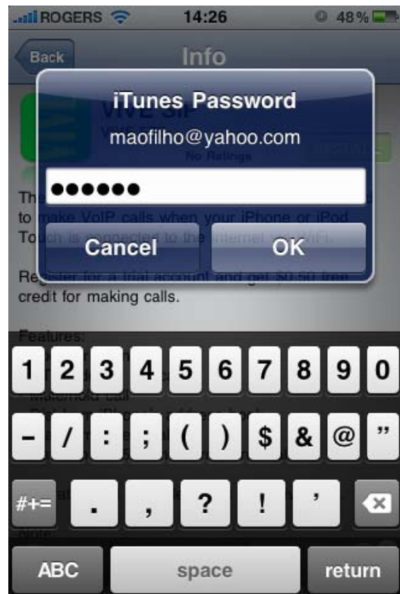
4. Enter your iTunes account information