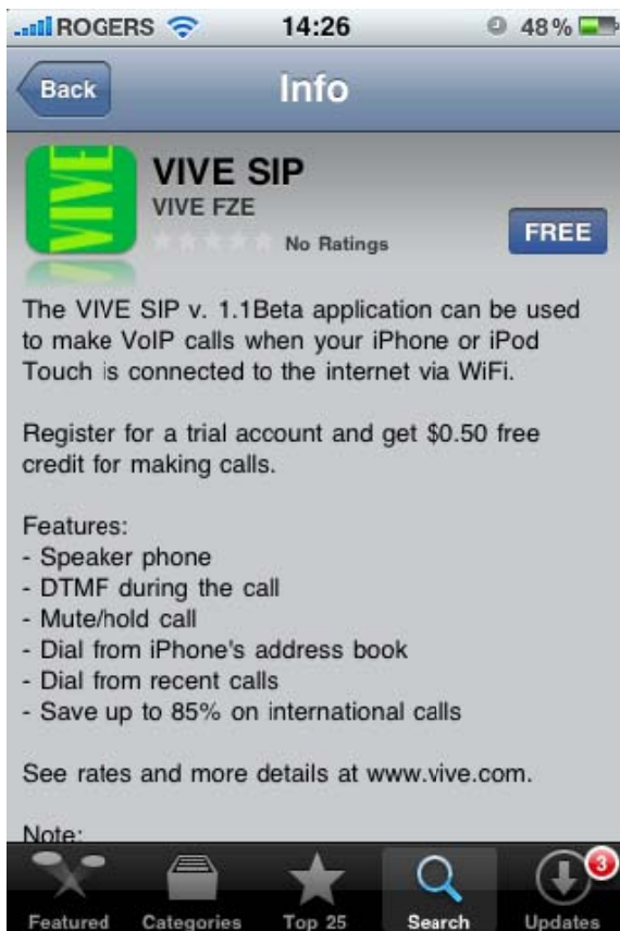
3. Click "Free" and then "Install"