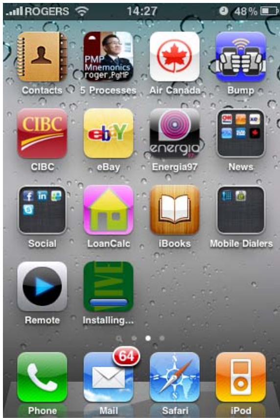
5. VIVE will be installed on your iPhone