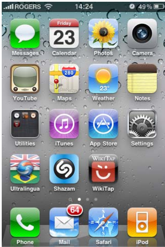
1. Open App Store